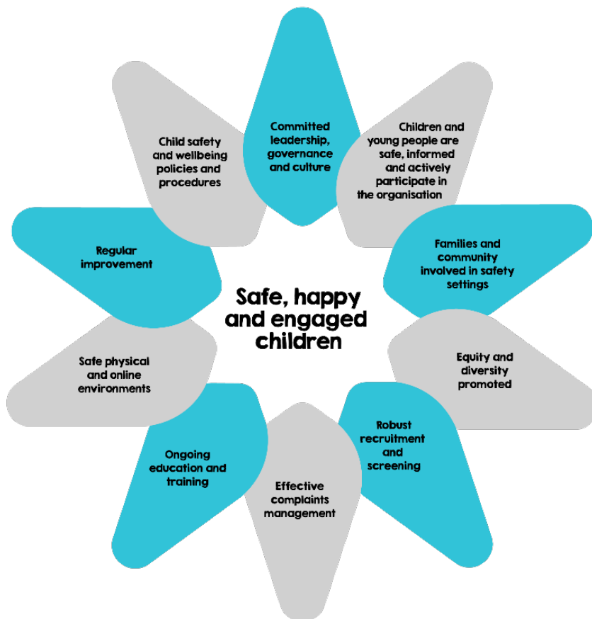
Wheel of Child Safety