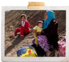
Iraq Crisis Appeal

These are just a few examples of the tireless effort and support that Act for Peace donors and supporters participated in. In a more recent appeal which is directing funds and support to those who are fleeing Iraq and Gaza from persecution, and are in urgent need of humanitarian aid for more information about this, go to: http://www.actforpeace.org.au/Get-Involved/Our-latest-appeals/Iraq-Crisis-Appeal#sthash.tA7NDz0Z.dpuf