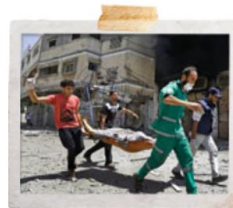
Gaza Crisis Appeal