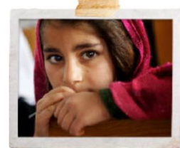
Help young girls in Afghanistan