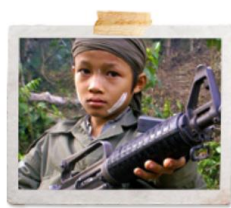
Child soldiers in Myanmar appeal