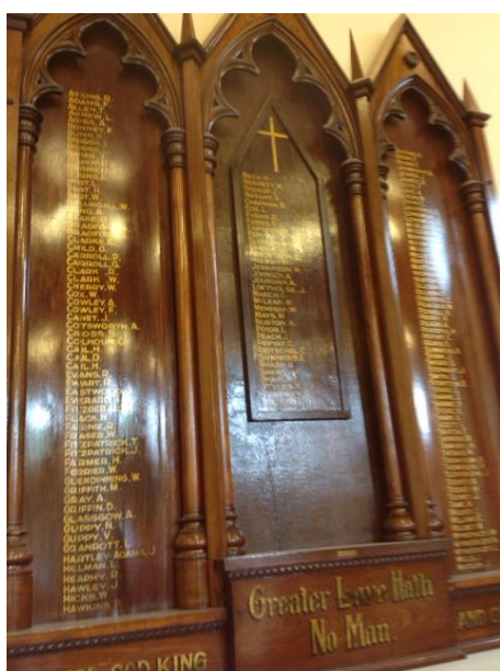
Christ Church Brunswick Plaque

The same is true for urban centres as for country towns. This huge plaque remembers those of Christ Church Brunswick.