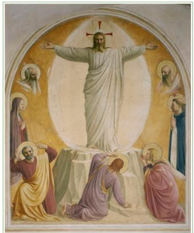
Blessed Fra Angelico, Guido di Pietro (c. 1395 – February 18, 1455)

He said quietly: "My mother and father gave this cross to the Church when my brother did not return from France in World War 1."