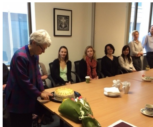
A welcoming cake