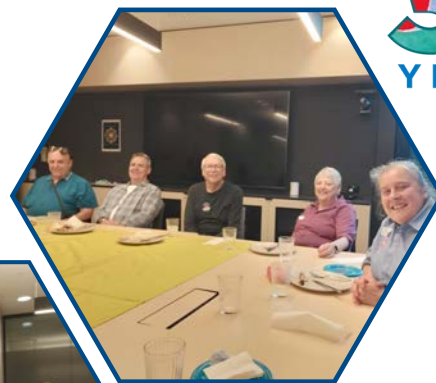
Below: member representatives at the National Forum, June 2024