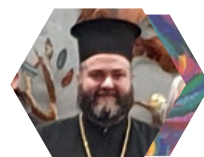
Bishop Bartholomew Greek Orthodox Archdiocese of Australia

Enabling and Resourcing Goal – Sustained member confidence in the value of NCCA