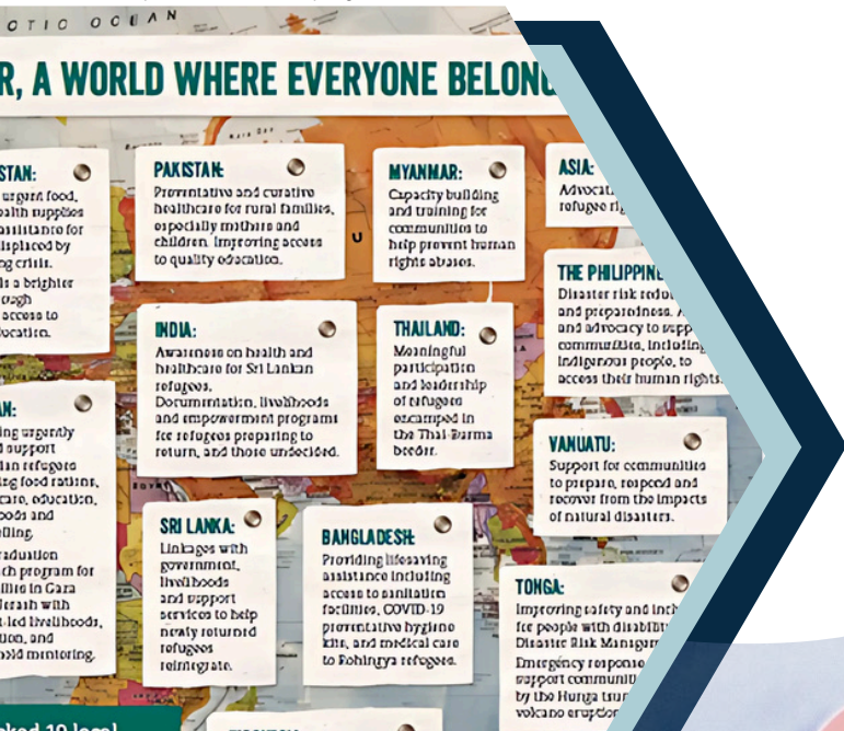
Below: AfP infographic from the 2024 Annual Report, showcasing the work map of countries and programs across more than 20 nations.

For more about AfP and the Christmas Bowl visit: https://www.actforpeace.org.au/