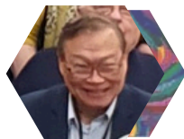
Thomas Ling Chinese Methodist Church in Australia