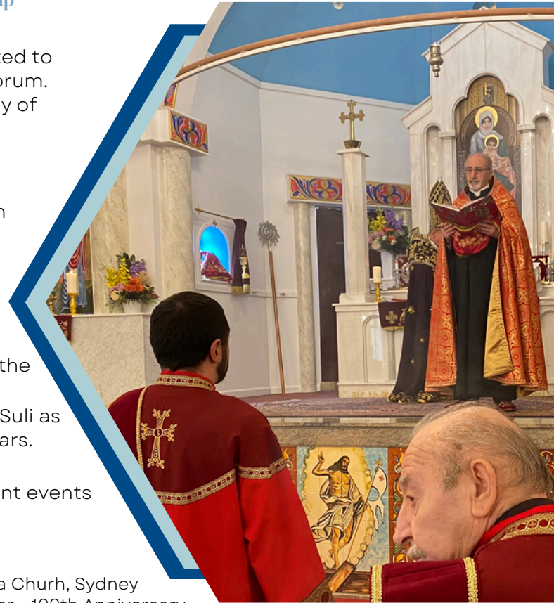
Above: Proclaiming the Gospel (Armenian Apostolic Church, Chatswood).