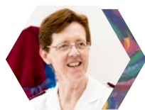
Commissioner Miriam Glyuas The Salvation Army Australia