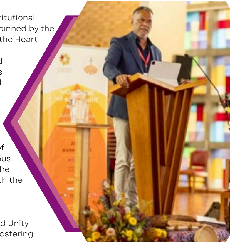
Top right, Prof Stan Grant speaks, 'Tribal Voices Conference' February 2024 Below, anti-clockwise: Entry procession, 'Tribal Voices' opening service; and Faith and Unity members meet in Melbourne, 2024 (both pictures)

This was an enriching experience of reflection and dialogue speaking into the national, regional and international levels of another church for the participants.